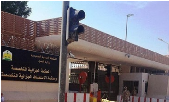
The Specialised Criminal Court in Riyadh