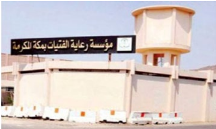
Young Women's Care Institution